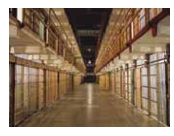
Law enforcement buildings